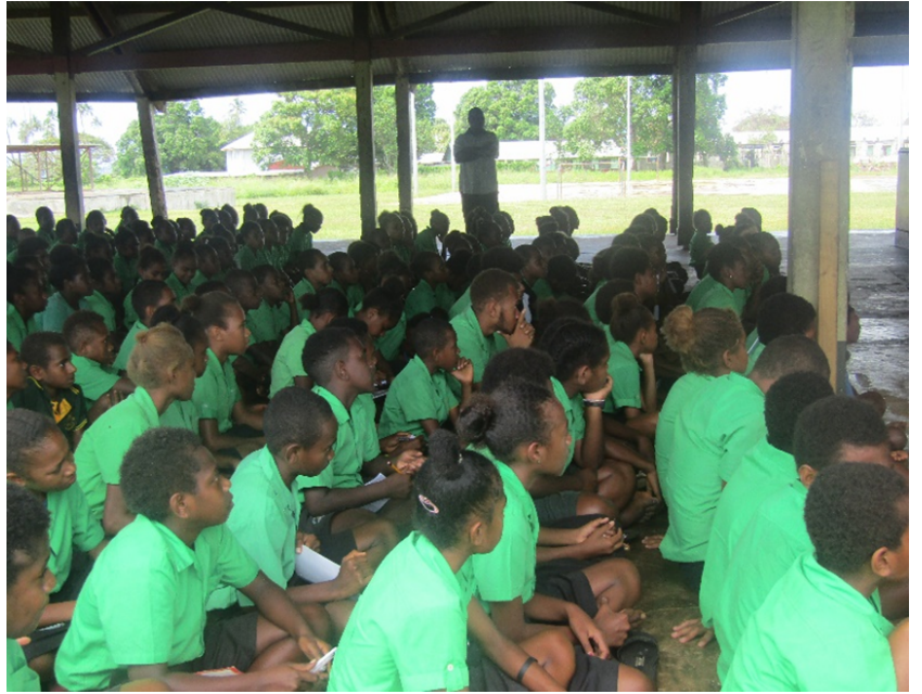
Picture: Students at Santo East School, Santo listen to a seminar on online safety

2019 marks a history for Vanuatu IGF, as we collaborate to establish this initiative with support from the Government of Vanuatu, Telecommunications Radiocommunications and Broadcasting Regulator (TRBR).