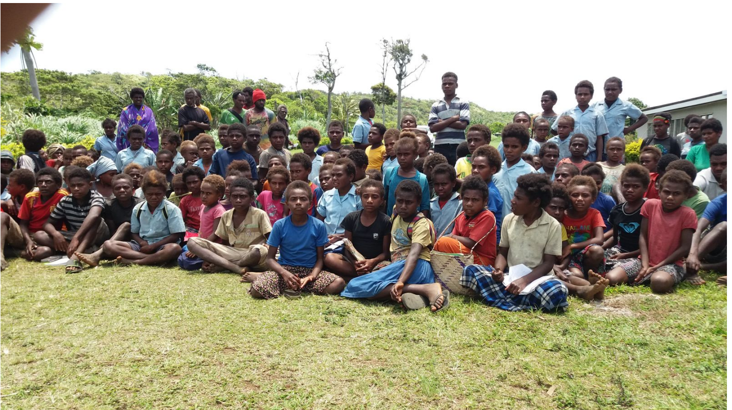
Picture: Internet continues to play an important role in educating our children. Enikis Primary School, North Tanna

As an internet governance entity, we must have a strong online presence, especially on Facebook where 90% of internet users in Vanuatu go online, to reach out to the community and provide support to keep the internet safer so more and more people can use the information they source from the internet to improve their lives and most importantly contribute to the socioeconomic development of Vanuatu.