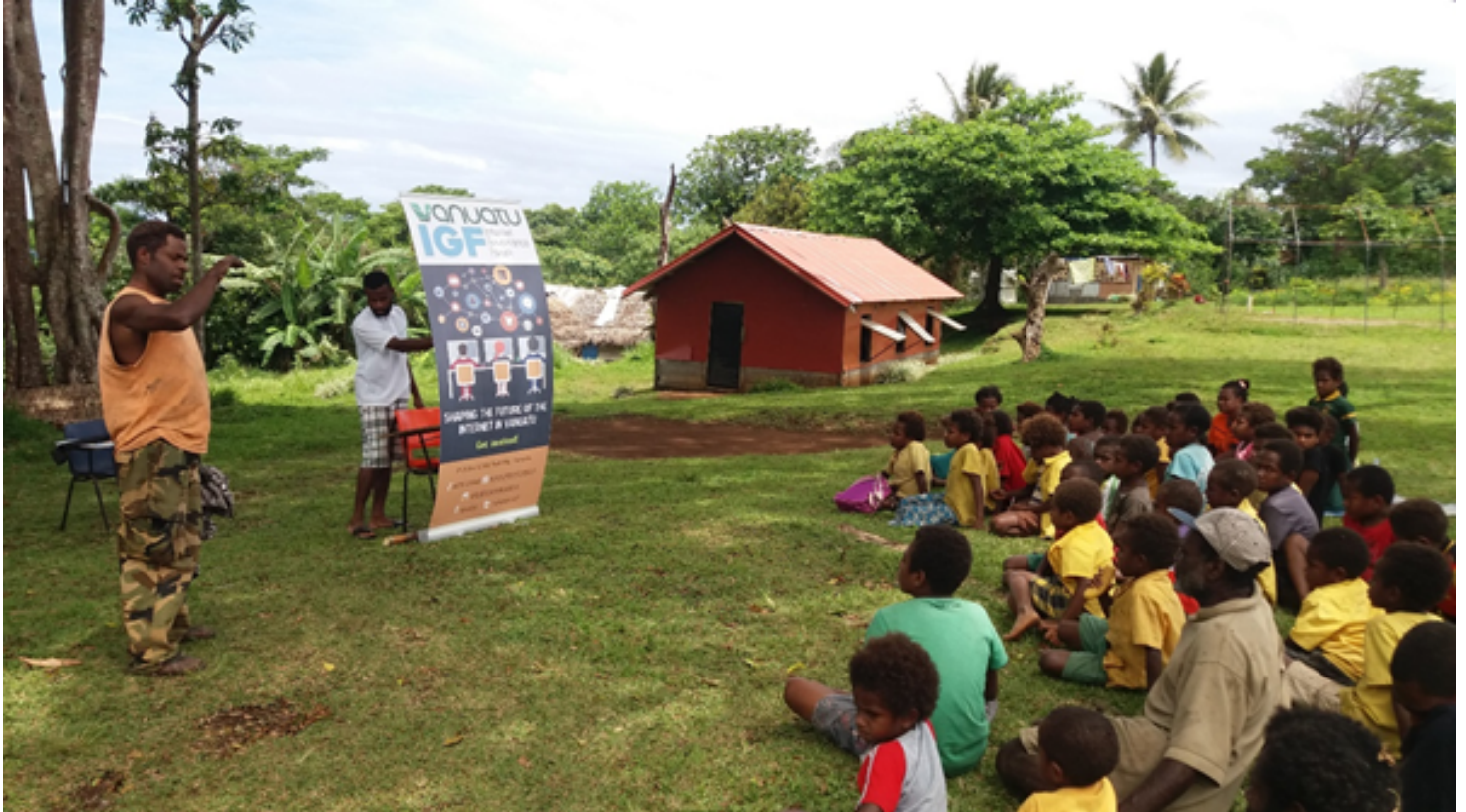
Picture: Vanuatu IGF works with our schools to talk about internet safety, students at Ecole Primarie de Itaku, South Tanna

We have been out into schools and villages and we can now see for ourselves that we accept that change is constant. It is the extent to which we care about the direction of social change that we can try to shape it and help to create the kind of "change we wish to see in Vanuatu